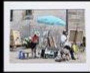
Merit Award Images