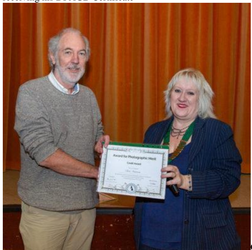
receiving his DPAGB Certificate