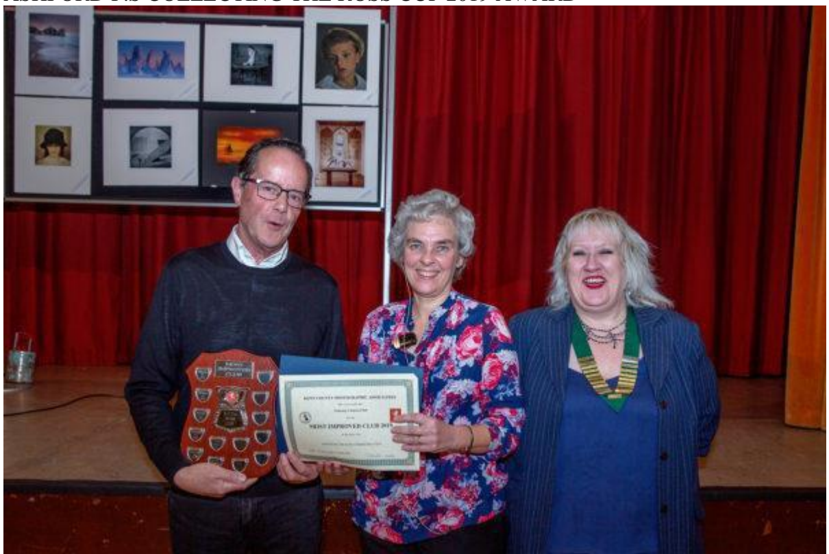
GATEWAY CC MOST IMPROVED CLUB