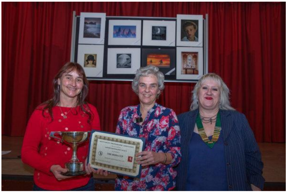
ASHFORD P.S COLLECTING THE ROSS CUP 2019 AWARD