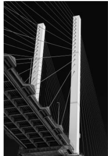
“The Bridge” Sandy Tolhurst