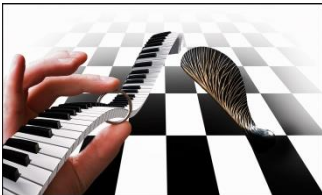
“Let the music ring out” Tom Burns